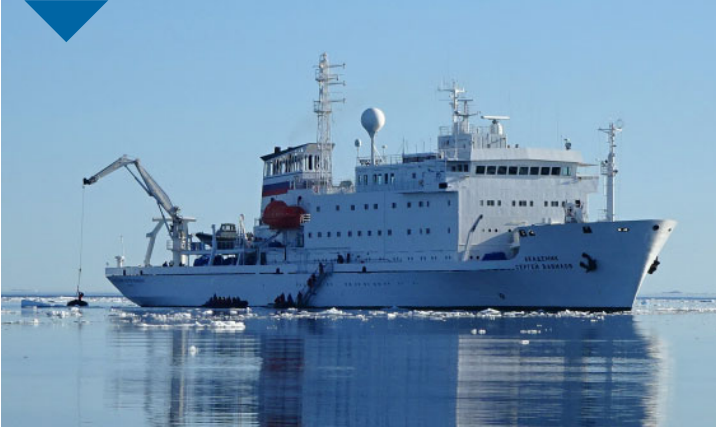
Akademik Sergey Vavilov (One Ocean Voyager)

Akademik Sergey Vavilov is the perfect size ship for visiting Antarctica. She carries no more than 92 passengers. This is under the maximum number of people allowed on shore (100), as mandated by the regulatory organization for tourism activities in Antarctica (IAATO). Being under this limit, means you will spend the maximum amount of time on shore, on EVERY single excursion. Once on shore, we break up into smaller special interest groups, with several hiking options, perhaps a visit to a penguin rookery, a historic site or a quiet stroll along the shoreline contemplating the magic. You decide how your day unfolds. Your time in Antarctica is precious and we aim to maximize your experience at every opportunity. To learn more about this exceptional vessel, request a copy of the Ship Fact Sheet containing detailed specifications and additional information about cabins and other facilities.