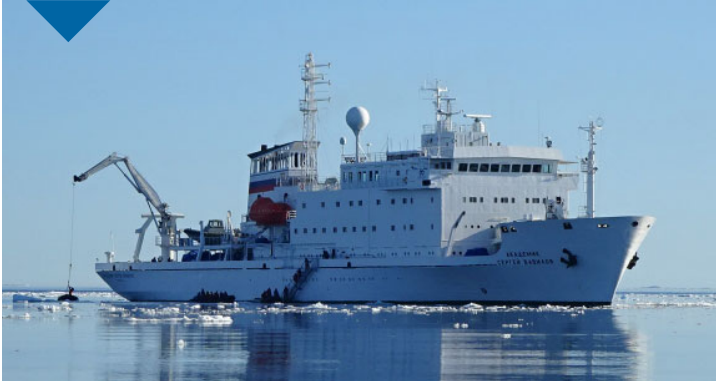
One Ocean Voyager (Akademik Sergey Vavilov)

Akademik Sergey Vavilov is the perfect size ship for visiting Antarctica. She carries no more than 92 passengers. This is under the maximum number of people allowed on shore (100), as mandated by the regulatory organization for tourism activities in Antarctica (IAATO). Being under this limit, means you will spend the maximum amount of time on shore, on EVERY single excursion. Once on shore, we break up into smaller special interest groups, with several hiking options, perhaps a visit to a penguin rookery, a historic site or a quiet stroll along the shoreline contemplating the magic. You decide how your day unfolds. Your time in Antarctica is precious and we aim to maximize your experience at every opportunity. To learn more about this exceptional vessel, request a copy of the Ship Fact Sheet containing detailed specifications and additional information about cabins and other facilities.