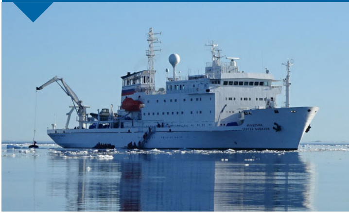
One Ocean Voyager (Akademik Sergey Vavilov)

Akademik Sergey Vavilov is the perfect size ship for visiting Antarctica. She carries no more than 92 passengers. This is under the maximum number of people allowed on shore (100), as mandated by the regulatory organization for tourism activities in Antarctica (IAATO). Being under this limit, means you will spend the maximum amount of time on shore, on EVERY single excursion. Once on shore, we break up into smaller special interest groups, with several hiking options, perhaps a visit to a penguin rookery, a historic site or a quiet stroll along the shoreline contemplating the magic. You decide how your day unfolds. Your time in Antarctica is precious and we aim to maximize your experience at every opportunity. To learn more about this exceptional vessel, request a copy of the Ship Fact Sheet containing detailed specifications and additional information about cabins and other facilities.