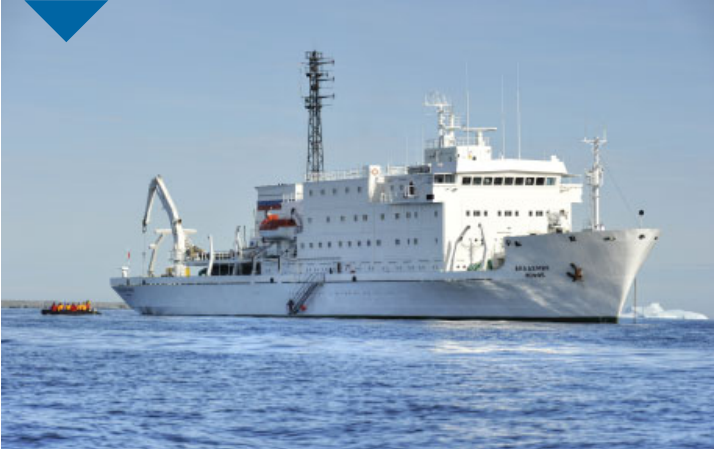
One Ocean Navigator (Akademik Ioffe)

Akademik Ioffe is the perfect size ship for visiting Antarctica. She carries no more than 96 passengers. This is under the maximum number of people allowed on shore (100), as mandated by the regulatory organization for tourism activities in Antarctica (IAATO). Being under this limit means you will spend the maximum amount of time on shore, on EVERY single excursion. We do not need to operate shuttles to and from the ship or run hurried excursions. Once on shore, we break up into smaller special interest groups, with several hiking options, perhaps a visit to a penguin rookery, a historic site or a quiet stroll along the shoreline contemplating the magic. You decide how your day unfolds. Your time in Antarctica is precious and we aim to maximize your experience at every opportunity. To learn more about this exceptional vessel, request a copy of the Ship Fact Sheet containing detailed specifications and additional information about cabins and other facilities.