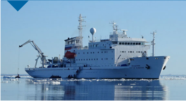
One Ocean Voyager (Akademik Sergey Vavilov)

Akademik Sergey Vavilov is the perfect size ship for visiting Antarctica. She carries no more than 92 passengers. This is under the maximum number of people allowed on shore (100), as mandated by the regulatory organization for tourism activities in Antarctica (IAATO). Being under this limit, means you will spend the maximum amount of time on shore, on EVERY single excursion. Once on shore, we break up into smaller special interest groups, with several hiking options, perhaps a visit to a penguin rookery, a historic site or a quiet stroll along the shoreline contemplating the magic. You decide how your day unfolds. Your time in Antarctica is precious and we aim to maximize your experience at every opportunity. To learn more about this exceptional vessel, request a copy of the Ship Fact Sheet containing detailed specifications and additional information about cabins and other facilities.