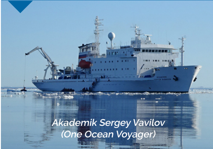
Akademik Sergey Vavilov (One Ocean Voyager)

The Akademik Sergey Vavilov is the perfect ship for Arctic exploration. She is a very spacious expedition vessel, yet the ship accommodates just 92 passengers. This makes all the difference when we disembark for our shore landings and zodiac excursions. Our fleet of zodiacs enable everyone to get off the ship at the same time. We do not need to operate shuttles to and from the ship or run hurried shore landings. This is the reality of a visit to Spitsbergen on larger capacity vessels. Our ship features the highest ice classification of any passenger vessel navigating in Spitsbergen (Class 1A). This allows us to safely push into areas of broken sea ice along the edges of the Arctic pack ice, located to the north of the archipelago. This ice transition zone is a place we frequently encounter seals, seabirds and polar bears and sightings from the ship are not uncommon. To learn more about this exceptional vessel, request a copy of the Ship Fact Sheet containing detailed specifications and additional information.